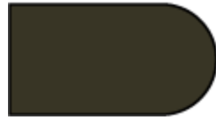
Walnut Brown SW4009 LRV 3%