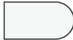
Gypsum* SW4028 LRV 72%