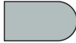
Slate Gray SW4026 LRV 36%