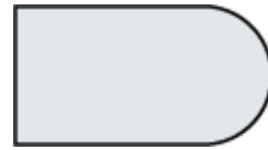
Galvano SW4027 LRV 58%