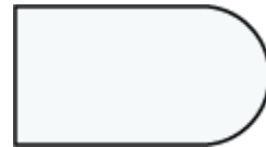
Pillar White SW4029 LRV 77%