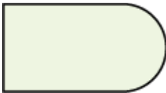
Cylinder Cream SW4005 LRV 74%