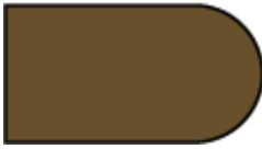
Bolt Brown SW4001 LRV 8%