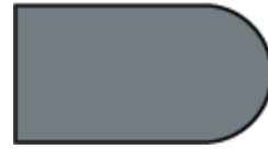
Gray SW4025 LRV 13%