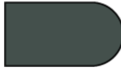
Graphite SW4017 LRV 5%