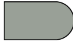
Structural Gray SW4031 LRV 24%