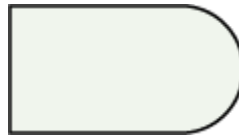
Filament SW4021 LRV 72%