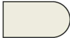
Ballast Beige*† SW4013 LRV 65%