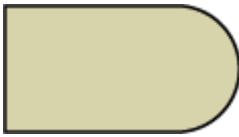
Pallet Tan SW4003 LRV 49%