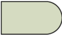
Lodestone SW4006 LRV 51%