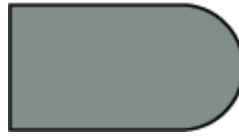
Tower Gray SW4018 LRV 18%