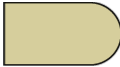
Pallet Tan SW 4003