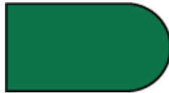
Safety Green SW 4085