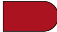
Safety Red SW 4081