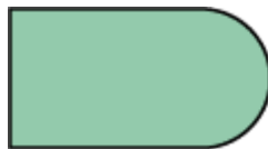
Generator Green SW 4070