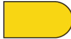
Safety Yellow SW 4084